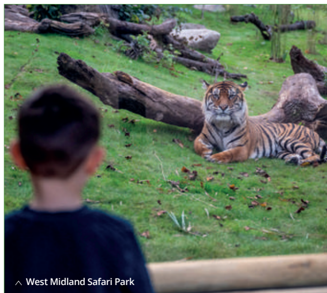
^ West Midland Safari Park

Those experiences will be delivered by vibrant, independent businesses firmly rooted in Worcestershire and offering the warmest of welcomes.