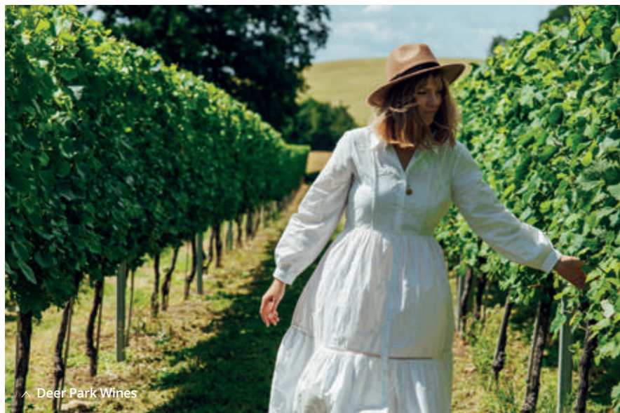
Deer Park Wines

This Plan is a shared commitment to develop, manage and market Worcestershire's visitor economy in a way which benefits all those involved in it - businesses, visitors, local communities - and the environment. It is the first Destination Management Plan (DMP) that has been produced for the county since Visit Worcestershire (VW) - now the accredited Local Visitor Economy Partnership (LVEP) for the county - transitioned into Worcestershire County Council in April 2020; a recognition of the importance of the visitor economy within the county's wider economic and social context. Showcasing a commitment now to continue to promote the visibility of the sector and achieve growth within it.