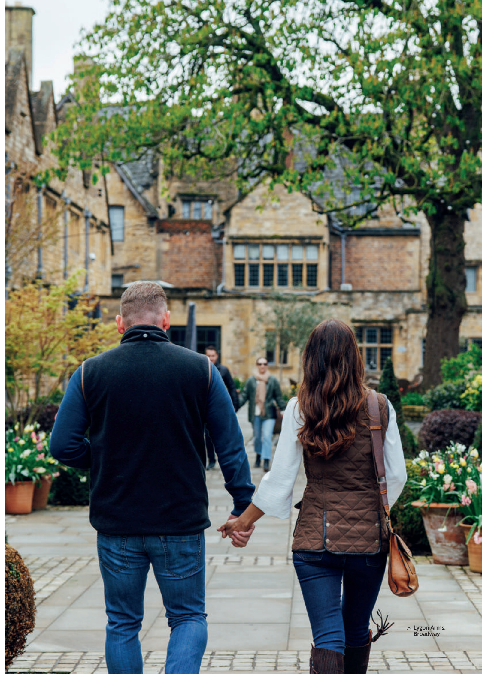
Lygon Arms, Broadway

The DMP establishes clear priorities and messages for the county to focus on over the next five years, it gives a clear outline of what needs to be done to make a difference and most importantly - what success looks like for Worcestershire.